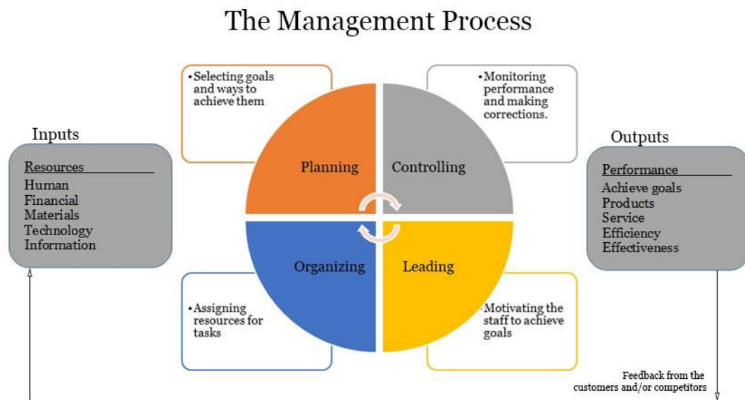
Picture 3. Management process

Source: Toppr, Management Skills , link: https://www.toppr.com/guides/business-management-and-entrepreneurship/nature-of-management-and-its-process/management-functions/ , [Accessed 11 Oct. 2020].